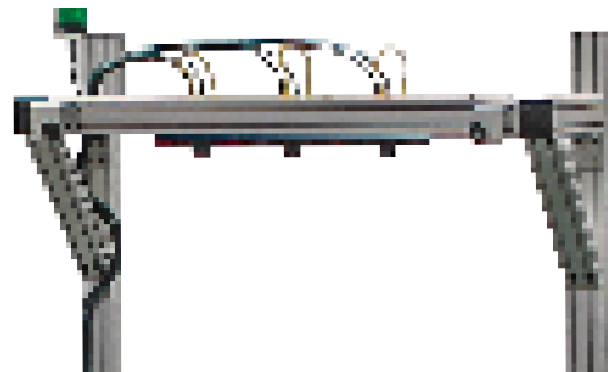
Single sided, top barcode scanner