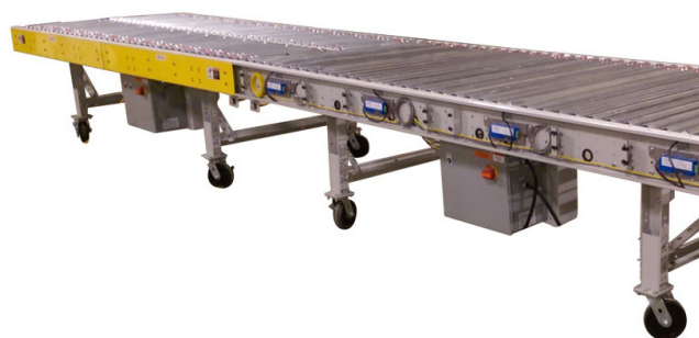
Heavy duty swivel casters